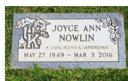
Left is level and right is bevel

The third option ... (scroll down to continue reading this section)