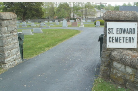
Above: Entrance to cemetery

For more than a century, this cemetery has served as the final resting place for members of Saint Edward. The continued care by the parish and volunteers will ensure that this cemetery remains a beautiful and important place of remembrance for years to come.