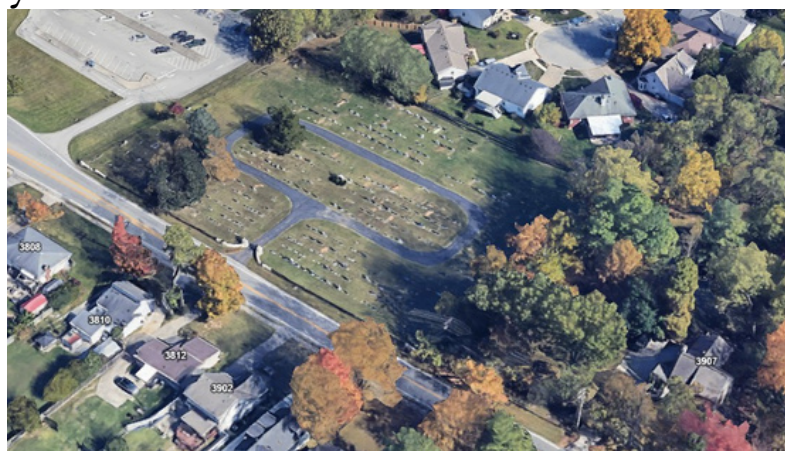
Right: Aerial view of Saint Joseph Cemetery