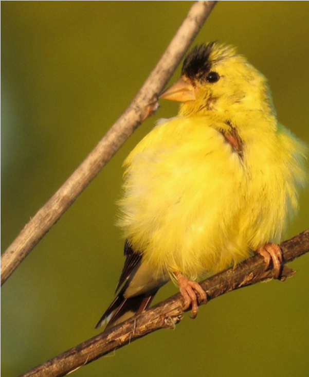
American goldfinch ( Spinus tristis )

The American goldfinch ( Spinus tristis ) is the most-sighted bird during the month of February. You can frequently see this bird in any of our cemeteries. It is a small North American bird in the finch family. It is migratory, ranging from mid-Alberta to North Carolina during the breeding season, and from just south of the Canada-United States border to Mexico during the winter.