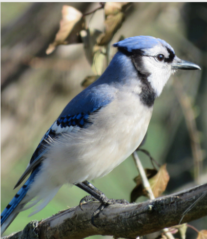
Blue Jay ( Cyanocitta cristata )

Another recently observed bird was this (see left) Blue Jay. Easily distinguishable due to their bright blue color, they are native to eastern North America. They have been known to mimic hawk calls. This is believed to be two-fold: to potentially warn other Blue Jays of a hawk's presence or to scare other birds away. They are quite boisterous in the fall because they are gathering food for the winter, so keep your ears open when visiting this autumn.