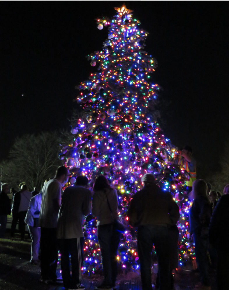
Lighting of the Tree, 2021

The Archdiocese of Louisville's Catholic Cemeteries has found a meaningful way to bring the warmth of Advent and Christmas to the cemetery with the Tree of Remembrance. Since 2016, about 400 people have gathered each year for the tree lighting and blessing ceremony.