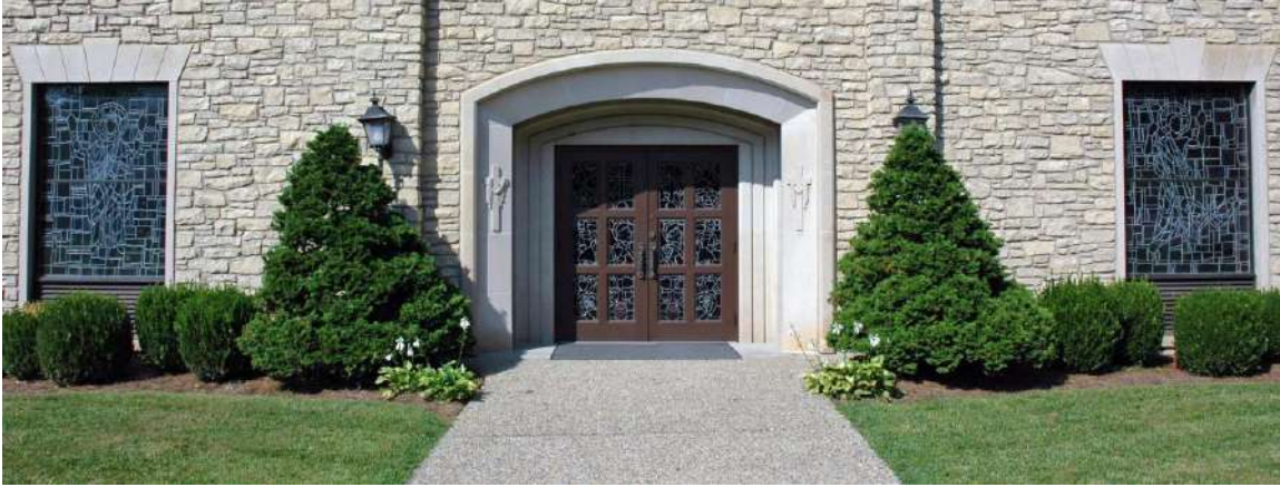
Entrance to Resurrection and Assumption Chapels/Columbariums

B. To request the opening of a grave, crypt or niche, the proper “Interment Request Form” provided by the Management must be used. The Management will not be responsible for the preparation of a grave unless the proper “Interment Request Form” has been properly executed and filed with the cemetery’s office at least 24 hours prior to the scheduled time of the service.