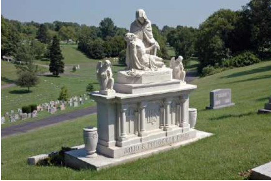
Calvary Cemetery – Established 1921 200 Acres