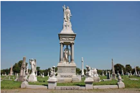
St. Louis Cemetery – Established 1867 43 Acres

We affirm the sacredness of human life and profess the resurrection of the body and everlasting life.