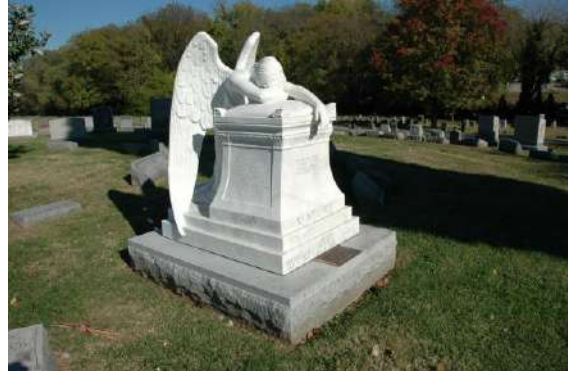
St. Michael Cemetery – Established 1851 48 Acres