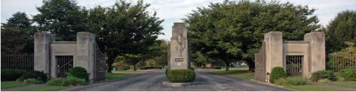
Main Entrance at Calvary Cemetery